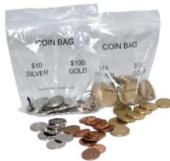
Mini Grip - reusable