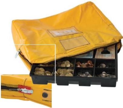
Till Drawer Bag

Money handling solutions for retail, business and banking institutions