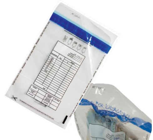
Cashier A5 - one time use