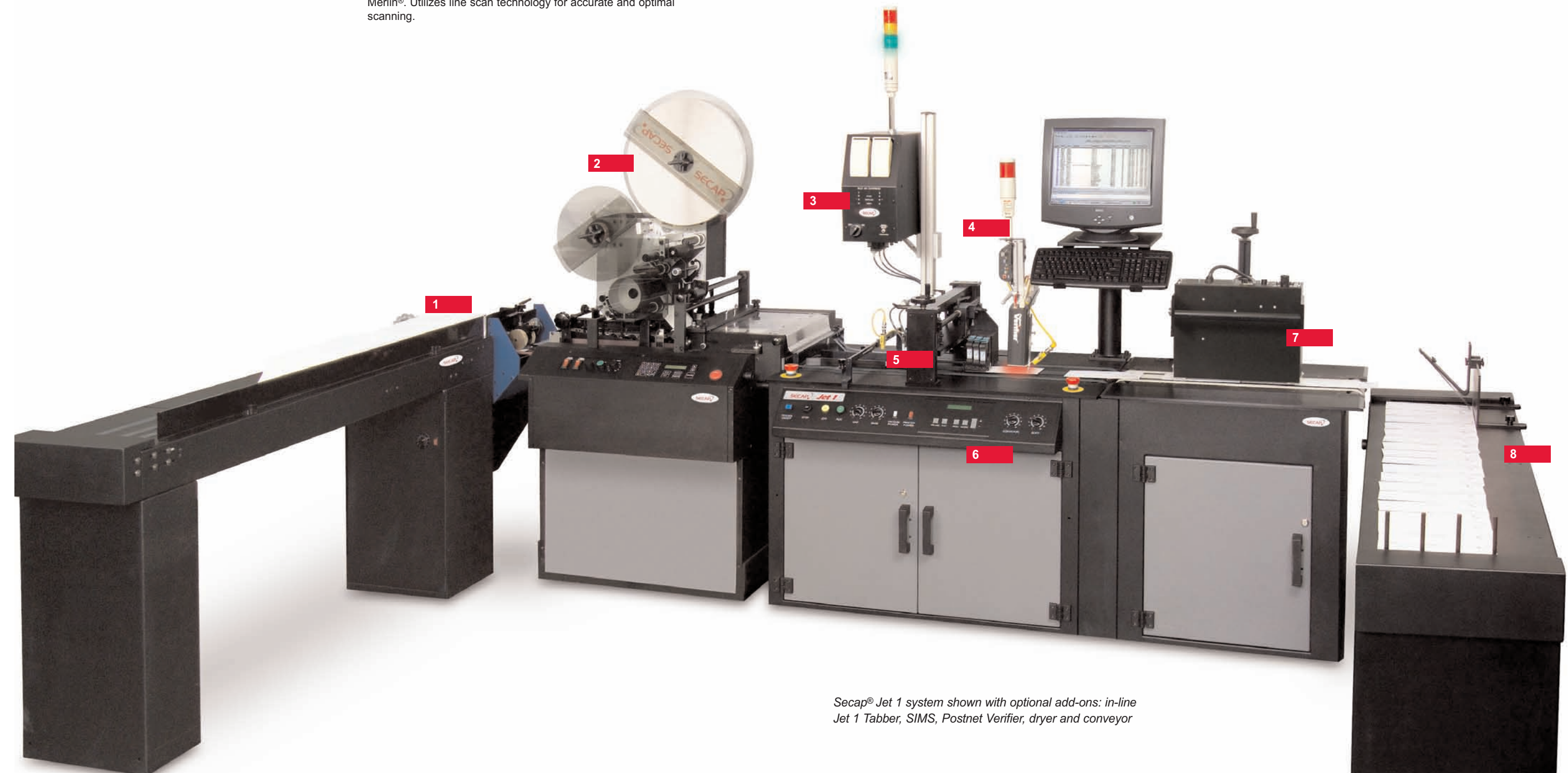
Secap® Jet 1 system shown with optional add-ons: in-line Jet 1 Tabber, SIMS, Postnet Verifier, dryer and conveyor