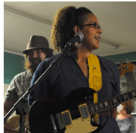
Alabama Shakes lead singer/ guitarist Brittany Howard with bassist Zac Cockrell