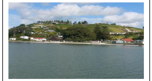
PAHI - KAIPARA HARBOUR

As we cruise through the sheltered inland waterways beside the Pouto peninsular we see many remote barren beaches with their white sands back dropped with the green of newly planted pine forests.