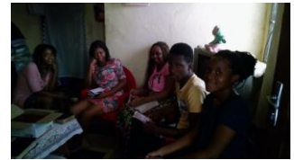
The girls are helping fold tracts for our soul winning time.