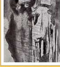
24. Susan Lick Sherman Photography 67 Lake Road, Fitzwilliam 603-885-6882 www.susanlicksherman.com From Rte. 119 and 12 in Fitzwilliam, follow 119 west 1.5 miles to Flax'n Depot. Straight on E. Lake Rd. to studio on left.