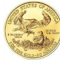
A permanent reminder of triumph over addiction