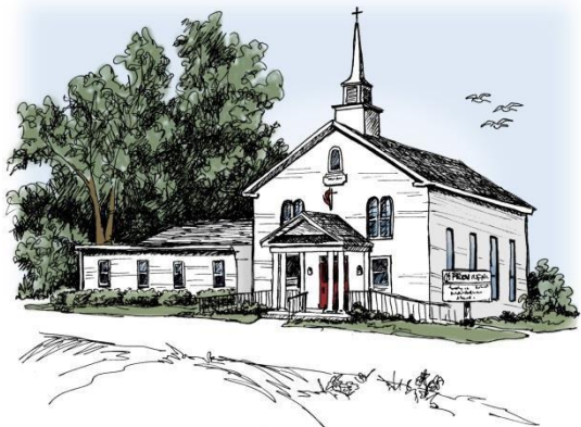
"The church on the curve."