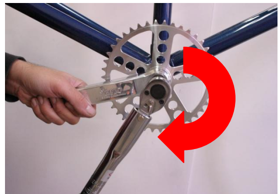
Fig.12 Tighten clockwise to 30 ft./lbs.

5. Walk over to the non-drive side of your bike and install the non-drive side crank arm in the same manner as described in Step 4. The non-drive side crank arm should be positioned 180° from the position of the drive side crank arm (Fig.13). Tighten the crank arm bolt to 30 ft./lbs. (Fig.14).