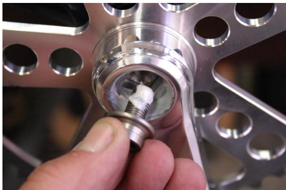
Fig.11 Grease bolt threads before inserting.

IMPORTANT NOTE: Do not over-tighten the crank arm bolts. The tapered style bottom bracket will allow you to squeeze the tapered bottom bracket spindle farther and farther into the crank arm until the spindle bottoms out, thus deforming the crank arm taper. Once the spindle bottoms out, the crank arm is rendered useless.