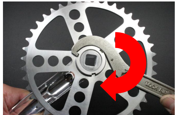
Fig.8 Use of hook spanner to tighten ring.

In lieu of a torque wrench, you can use a 3/8" ratchet with the crank lock ring tool. As a last resort, you can carefully use a hook spanner wrench to tighten the lock ring (Fig.8). Just remember, if you use the 3/8" ratchet or the hook spanner, you cannot accurately measure the torque applied to the lock ring. You also run a higher risk of rounding off the lock ring notches when you use the hook spanner.