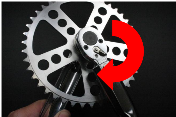
Fig.7 Tighten clockwise, 30 ft./lbs.