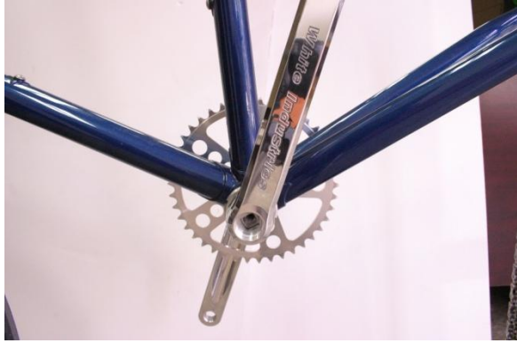
Fig.13 Left side 180° from right side arm.