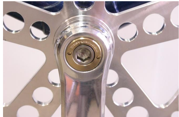
Fig.16 Bronze self-extracting ring installed.

7. Time for your pedals to go on. Install them according to the manufacturer's recommendations. The drive side crank has a right hand thread for the pedal and the non-drive side has a left hand thread. Take your bike on a short ride in your neighborhood. Tighten the crank bolts again to 30 ft./lbs. when you get back. Now the cranks are properly installed. Enjoy!