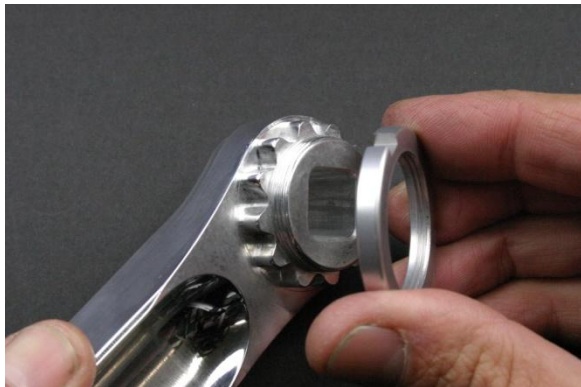
Fig.1 Remove crank lock ring.