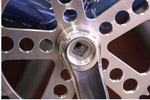
Fig.9 Crank arm placed on spindle.