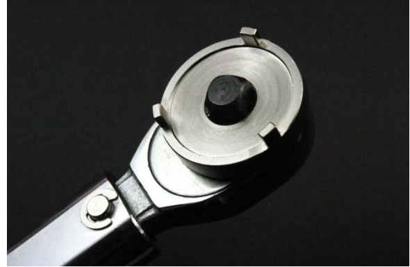
Fig.6 ENO/VBC crank lock ring tool.