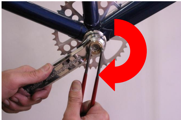
Fig.15 Tighten bronze rings clockwise.

6. Now take the two bronze self-extracting rings and thread them into each of the crank arms. You can start these by hand and finish tightening them with a pin spanner wrench. These are right hand threads, so the rings will tighten clockwise (Fig.15). Don't over tighten them, snug is fine.