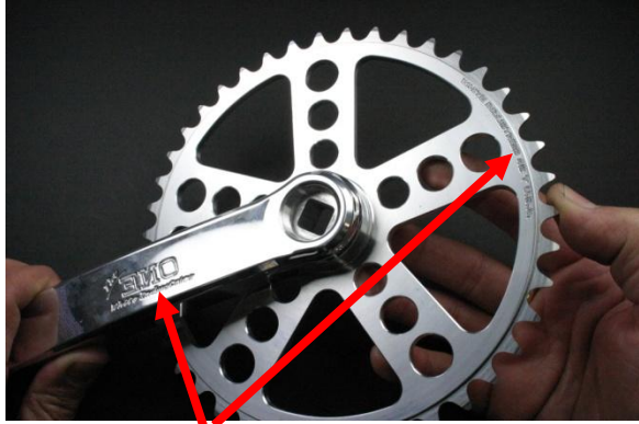
Fig.3 Both logos visible on drive side.

3. Next, take a look at the lock ring. On one side, the threading goes all the way to the edge of the lock ring's outer face. On the other side, the threads end about 2mm from the edge of the outside face (Fig.4). The side with the 2mm unthreaded area needs to rest against the chain ring when installed, in order to properly secure the chain ring.