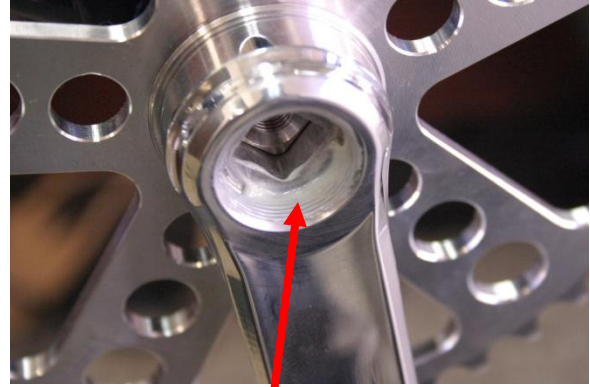
Fig.10 Threads greased in crank arm.

Grease the threads of crank arm bolt, since October 2010 we have included crank arm bolts with our cranks arms, and thread into the bottom bracket spindle (Fig.11). Using a torque wrench and an 8mm hex bit, tighten the crank arm bolt to 30 ft./lbs. (Fig.12).