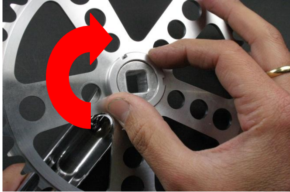
Fig.5 Turn lock ring clockwise to tighten.