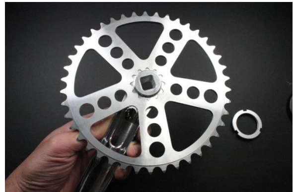
Fig.2 Place chain ring on spline.