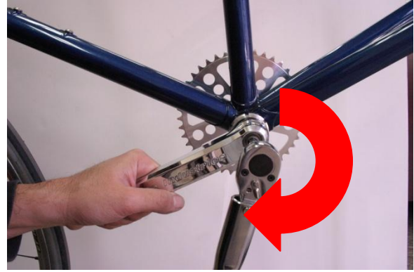
Fig.14. Tighten clockwise to 30 ft./lbs.

6. Now take the two bronze self-extracting rings and thread them into each of the crank arms. You can start these by hand and finish tightening them with a pin spanner wrench. These are right hand threads, so the rings will tighten clockwise (Fig.15). Don't over tighten them, snug is fine.