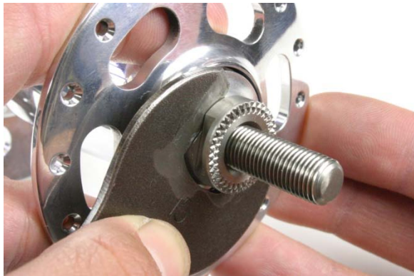
Fig.16 Wrench on flats of cone nut.

4. Place a 15mm cone wrench on the flats of the aluminum cone nut and hold it at about 7 o'clock (Fig.16). Place your second 15mm cone wrench on the flats of the steel lock nut at approximately 5 o'clock. Hold the wrench on the aluminum cone nut in place as you tighten the steel lock nut by turning it clockwise.