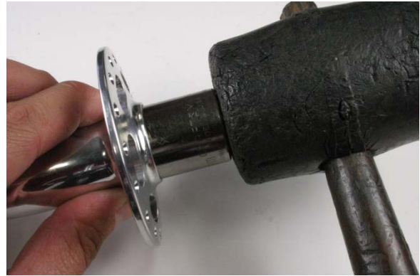
Fig.10 Fully seat bearing in bore.

2. Insert axle assembly into hub shell (Fig.11). Tap the axle with the mallet to fully seat it against the bearing. (Fig.12 & 13).