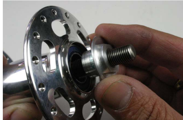
Fig.6 Remove cone nut.