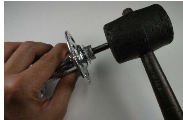
Fig.12 Tap axle end to fully seat.