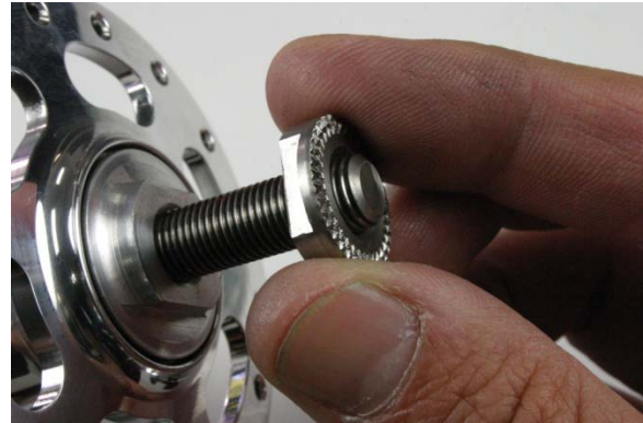
Fig.15 Installing steel lock nut.

4. Place a 15mm cone wrench on the flats of the aluminum cone nut and hold it at about 7 o'clock (Fig.16). Place your second 15mm cone wrench on the flats of the steel lock nut at approximately 5 o'clock. Hold the wrench on the aluminum cone nut in place as you tighten the steel lock nut by turning it clockwise.