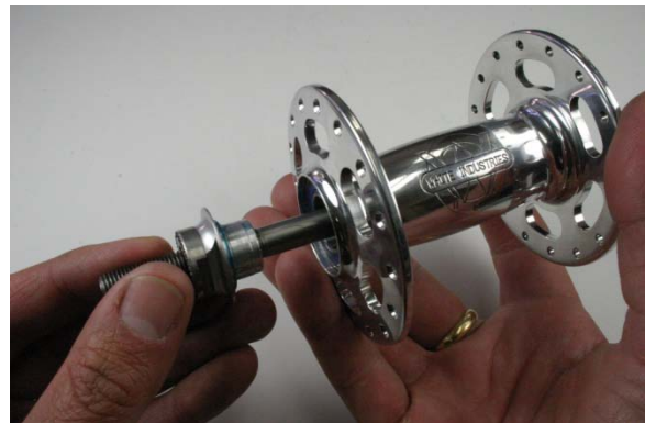
Fig.8 Withdraw axle assembly from shell.