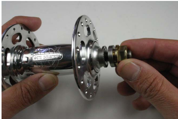
Fig.1. Removing axle nuts.