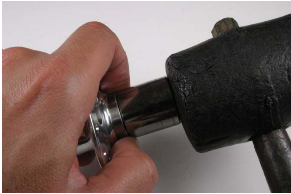
Fig.9 Tapping bearing into bore.

used a 20mm socket. Align the socket with the bearing race and use a mallet to tap the bearing into place (Fig.9 & 10). Do not tap on the bearing seal or inner race as this can damage the bearing beyond repair. Make sure the bearing presses into the bearing bore straight.