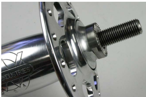
Fig.13 Axle is fully seated.

3. Install the aluminum cone nut by threading it onto the axle until it seats fully against the bearing (Fig.14). Make sure that it is only finger tight. Next, thread on the steel locknut with the