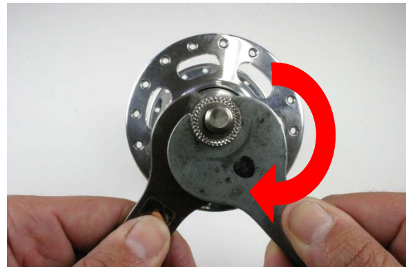
Fig.17 Hold cone nut and tighten lock nut.

5. Once the lock nut is tight, check for lateral play by placing the palm of your hands or thumbs on both ends of the axle. Push back and forth. You should not feel the axle moving laterally if the hub is adjusted properly. Next, spin the axle with your fingers and check for any tightness or binding. If you feel any play or binding, the hub will need to readjusted.