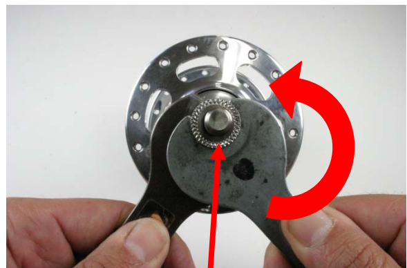
Fig.4 Turn steel lock nut counter-clockwise.