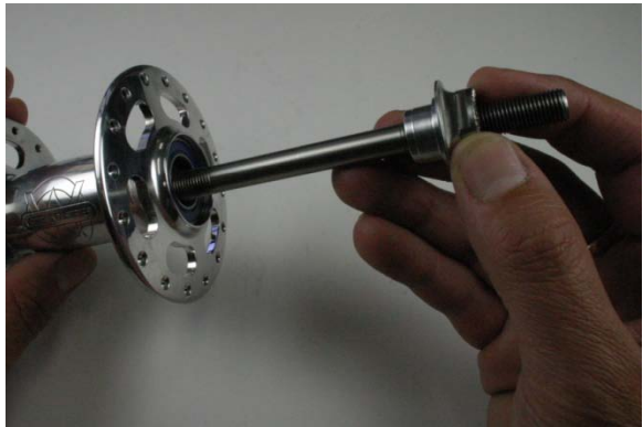
Fig.11 Installing axle assembly.

2. Insert axle assembly into hub shell (Fig.11). Tap the axle with the mallet to fully seat it against the bearing. (Fig.12 & 13).