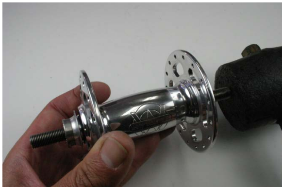
Fig.7 Tap axle assembly out of shell.