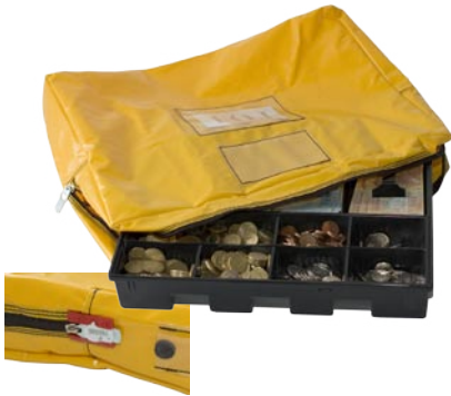
Till Drawer Bag

Money handling solutions for retail, business and banking institutions