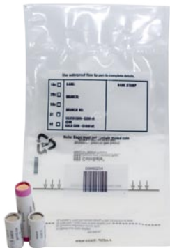
Bulk Coin - one time use