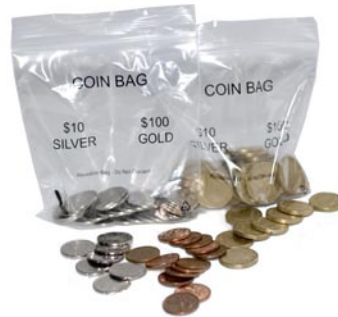
Mini Grip - reusable