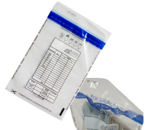
Cashier A5 - one time use