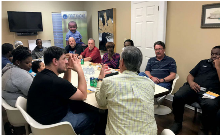
From our February group session of Fathers First... we are thankful to see God at work in these men's lives!

We thought you might be interested in hearing some of the topics that are covered... each session starts with a meal and a teaching on some issue relevant to fathers (taught by a father, of course), and is followed by a group discussion.