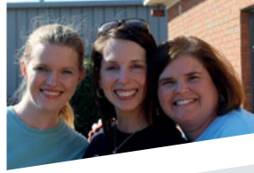
Local churches pitch in to serve pg3