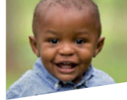
New Additions pg3