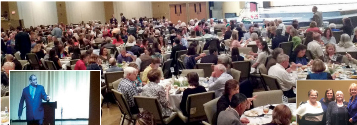
A rare moment—the staff of Sav-A-Life gather for a group photo!

Adams Drugs • Alfa Foundation • Baptist Health • Goodwin Animal Hospital Jack Ingram Motors, Inc. • Oakworth Capital Bank