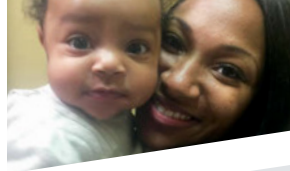
New Additions pg3