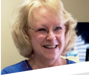
Farewell and Thanks pg2