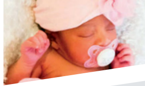
New Additions pg3