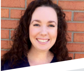
New Staff Member pg2