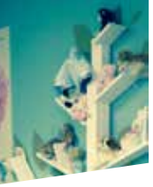
first things refurbished pg3