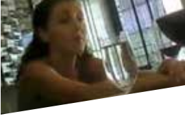
response to planned parenthood scandal pg3